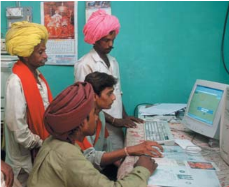
FARMERS ACCESS the Gyandoot intranet at a community computer facility in central India's Dhar district, where 60 percent of the 1.7 million residents live below the poverty line. The intranet provides crop prices, official application forms, and a place to hold village auctions and to air public grievances.