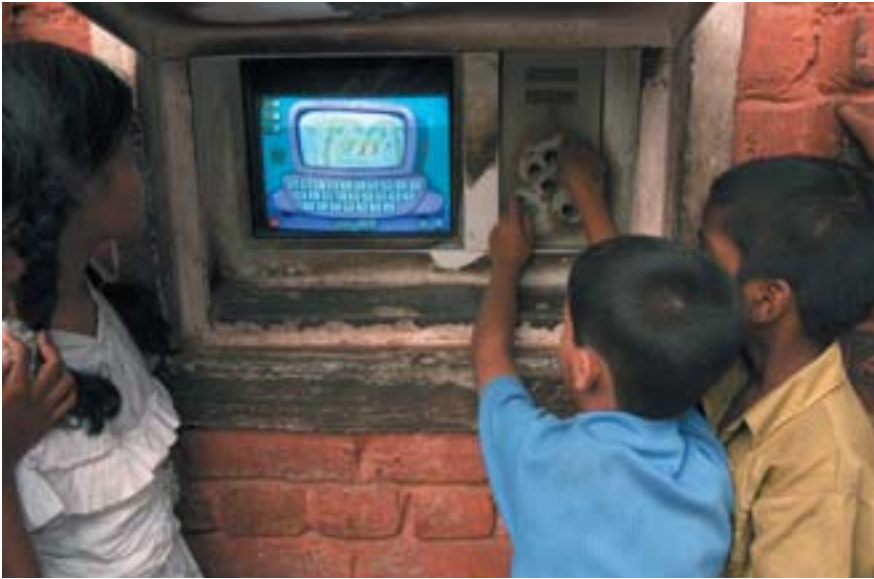
NEW DELHI CHILDREN experiment with what is literally a hole-in-the-wall computer in 2000. The minimally invasive education project was designed to insert technology into the environment so that the children would learn to use the computer without guidance. Without direction, however, the computer proved for the most part to be merely a high-tech toy.

launched an experiment to provide computer access to children in one of the city's poorest areas. Government officials and representatives of the company set up an outdoor kiosk with several computer stations. The computers, with dial-up Internet access, were inside a locked booth, but the monitors, joysticks and buttons stuck out through holes and were accessible. In line with a concept known as minimally invasive education, the test included no teachers or instructors. The idea was to allow the children unfettered daily access so they could learn at their own pace rather than through the directives of adults.