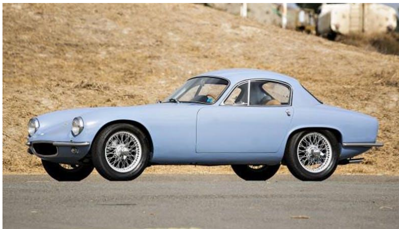
Figure 4. Erin's Baby Blue Lotus Coupe