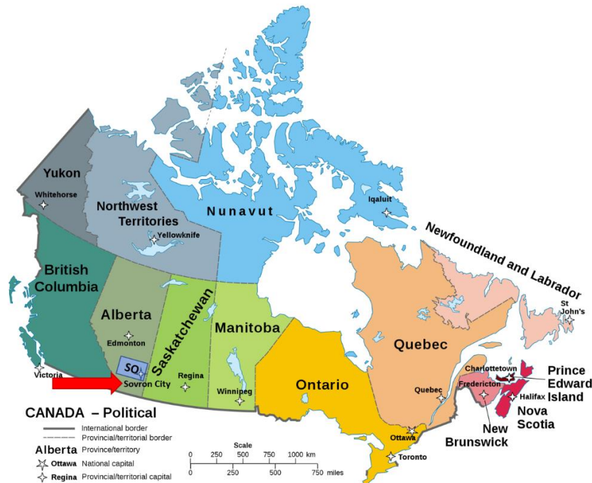
Figure 1. Erin lives in Sovron City, Sovronia, Canada