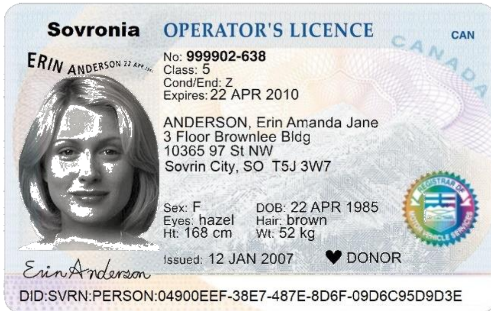
Figure 2. Erin's New Sovronia Driver's License (Operator's License)