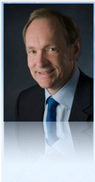
Tim Berners-Lee WEB INVENTOR AND W3C DIRECTOR